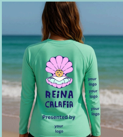
OFFICIAL COMPETITION RASH GUARD