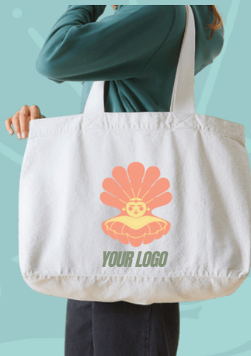
OFFICIAL REINA CALAFIA MERCHANDISE