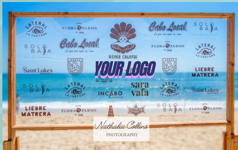
SIGNAGE & BRANDED SPACES